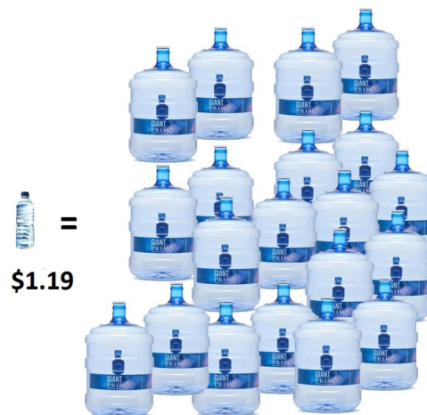
100 gallons of S&T Water

$1.19/100 gallons describes the price of good safe S&T water delivered to your door on demand.