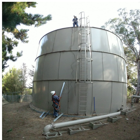
New safety railing being installed on our North Tank.

From all of us at S&T we wish you health and happiness for 2021.